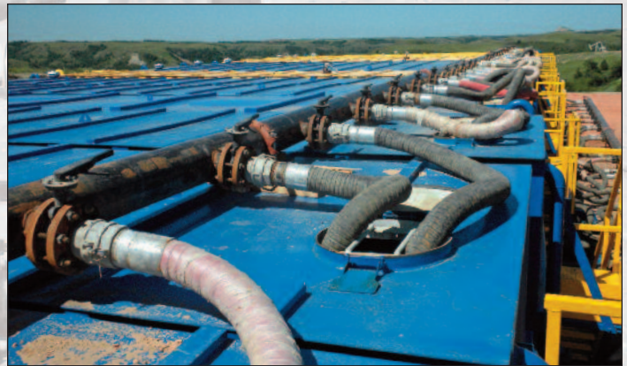
Crimpology fittings at work ... stopping leaks and blow-offs!